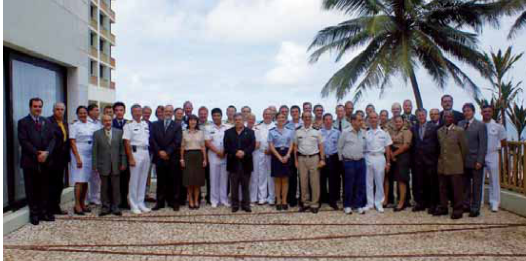
Group photo of participants at the SDFDS Congress, 30 August – 2 September 2010.