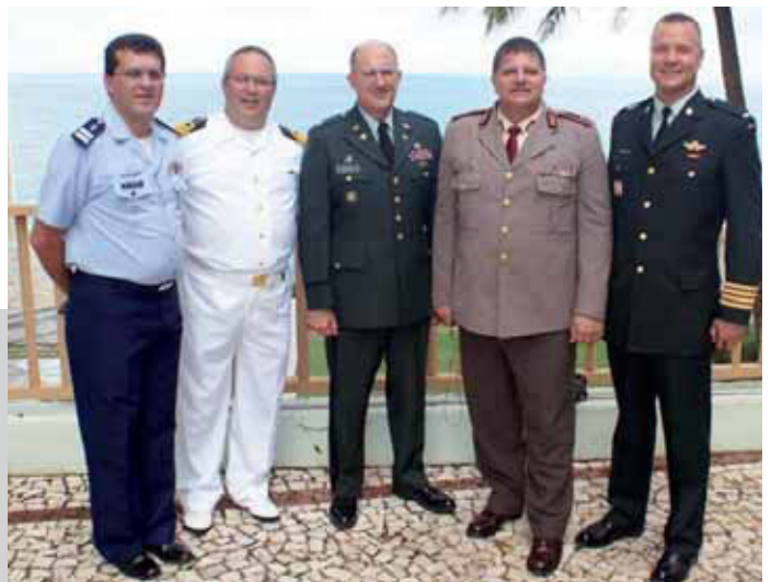
Five participants representing three continents: colleagues from Brazil, Turkey, USA, South Africa and Canada