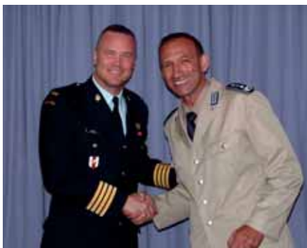
The author with a colleague from Canada